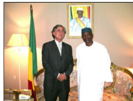
Pres. Amadou Tamani Toure and Max

The Premier of Western Australia, The Hon. Dr Geoff Gallop, seconded the Foreign Affairs Minister's approval for a Consulate of Mali to be established in Western Australia .